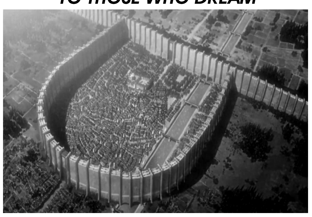
OF LIFE BEYOND THE WALLS